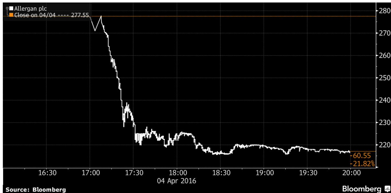
Figure 1: Allergan Stock Plummets over 20% Following Treasury Rule that Blocks Inversions 81